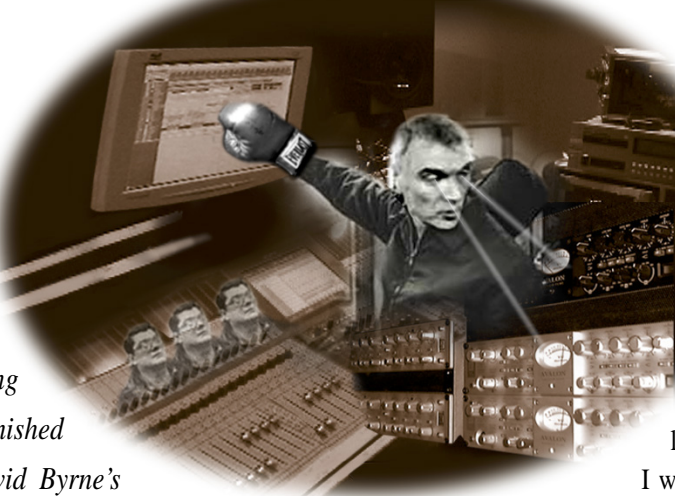
David Making Magic

A: We go back and forth between recording to two inch analog tape and direct to computer recording depending on the song and the sound. On David Byrne's recent album, "Look Into the Eyeball," we recorded most of drums to two inch tape and then dumped it into Logic so that it could be manipulated from there. We did this to get a warmer, punchier analog sound.